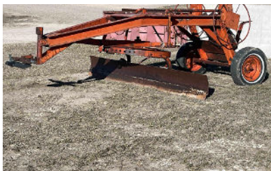
Stockland Pull Type Grader

Kubota V1702 4 Cylinder Diesel Engine, 6' Bar Length, 48" digging depth, Alternating Carbide tips, 69" backfill blade