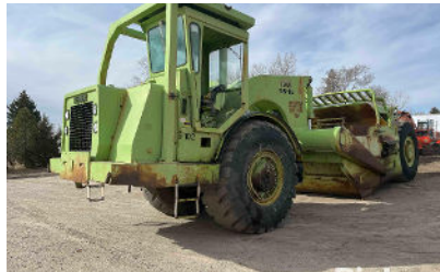
Terex TS 18 Self Propelled Scraper

Push-Pull Scraper, Allison Air Shift 6 speed automatic transmission, 18 cubic yard capacity