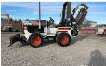
Bobcat 3023 4x4 Trencher with Backfill Blade

Kubota V1305-EU6 Diesel Engine, 12 in tracks, 84" Boom, 48" Stick, 58" width, backfill blade 67"