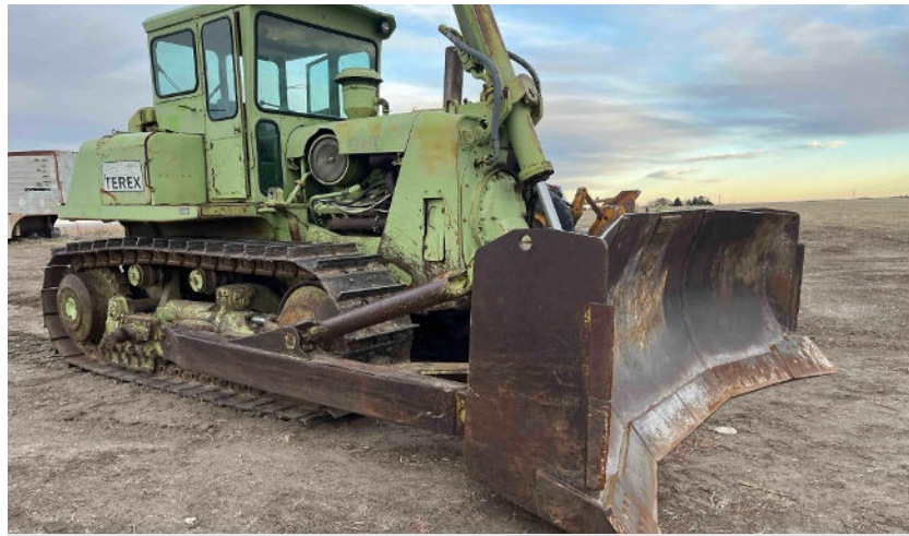
Terex 82-40 Dozer with Detroit 8V71T Turbo-Charged Engine

Caterpillar 6 cylinder turbo charged diesel engine with glow plugs, 3 valves, 4.5 cubic yard bucket, -5.5 cubic yards heaped, 29.5R-25 Tires, 120" Bucket, Air Brakes, Near new cutting edge.