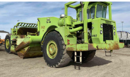
Terex TS 18 Self Propelled Scraper

Powershift, 12'6" Wide U Blade, 54" Blade Height, Replacable Edge, 25" track width