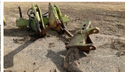
Wehr 33-2 Ripper Attachment

10' Blade, Manual Adjustment, 15' Length