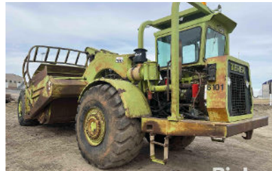
Terex TS 14 B Self Propelled Scraper

Detroit 8V71 Engine, (Rebuilt Short Block and Parts Engine included) 33.25-35 Tires