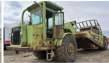
Terex TS14B Self Propelled Scraper

14 cubic yard capacity plus sideboard capacity, Air shift automatic transmission, Detroit 4-71 Engine