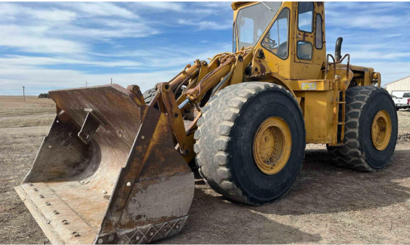
Caterpillar 980B Wheel Loader with 4.5 cu. yd. bucket

Caterpillar 6 cylinder turbo charged diesel engine with glow plugs, 3 valves, 4.5 cubic yard bucket, -5.5 cubic yards heaped, 29.5R-25 Tires, 120" Bucket, Air Brakes, Near new cutting edge.