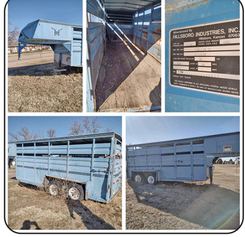
• 1989 Hillsboro Inds - 7 ft x 16 ft Trailer