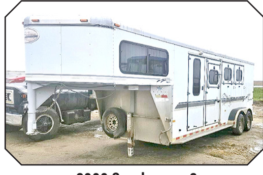
• 2000 Sundowner 3 horse slant trailer (good)