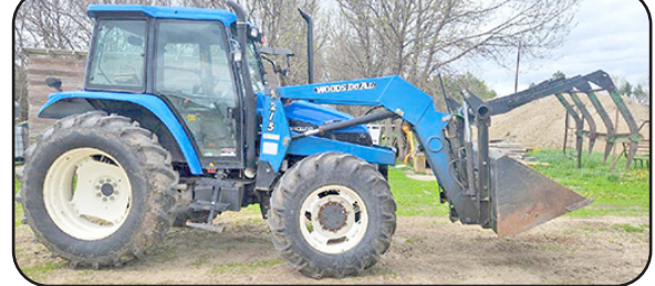
• 01 New Holland TS110 MFD, Dual 215 loader & grapple, joystick, 4 brand new tires, 9,834 hrs. Runs great. No oil leaks. Starts right up in cold weather. 2 remotes. 540/1,000 PTO. New rear wheel seal on left axle. AC works good.