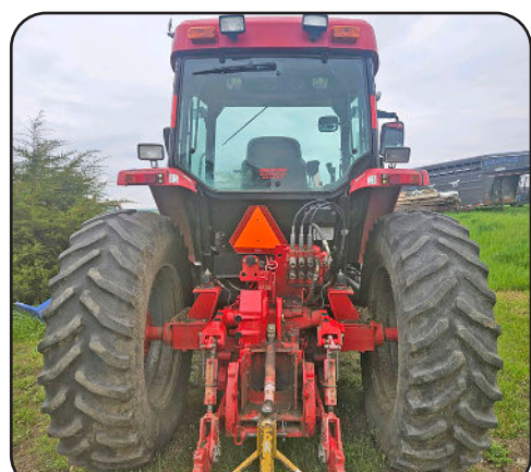
• MTX 120 Case Tractor - 4,000 hours w/loader