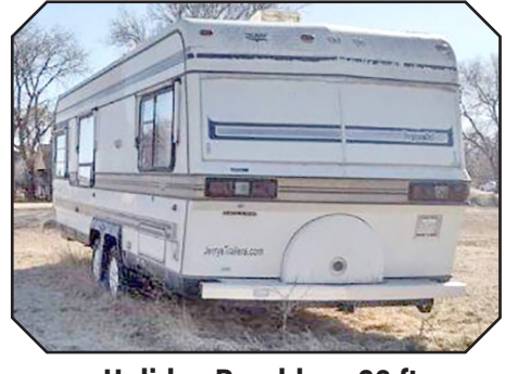
• Holiday Rambler - 28 ft.