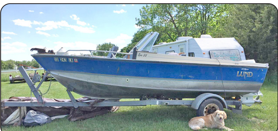
• Lund 18 ft. boat - 115hp Johnson Motor