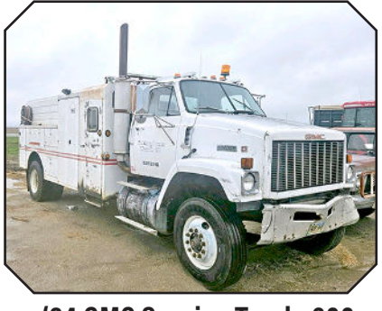
• '84 GMC Service Truck, 600 gallon fuel tank, 855 Cummins, 9 spd