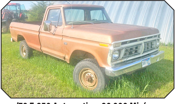
• '76 F-250 Automatic - 90,000 Mi. (runs good, one owner)